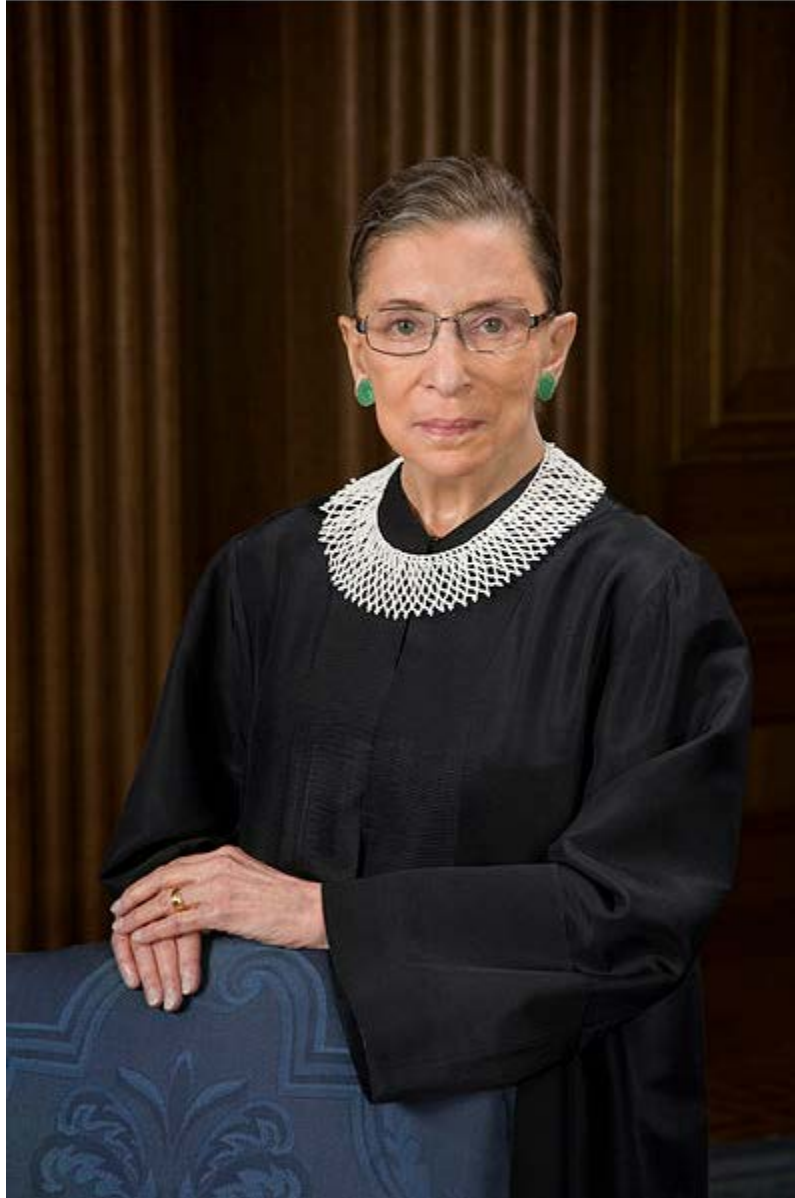
Supreme Court Justice Ruth Bader Ginsburg

https://commons.wikimedia.org/wiki/File:Ruth_Bader_Ginsburg_official_SCOTUS_portrait.jpg