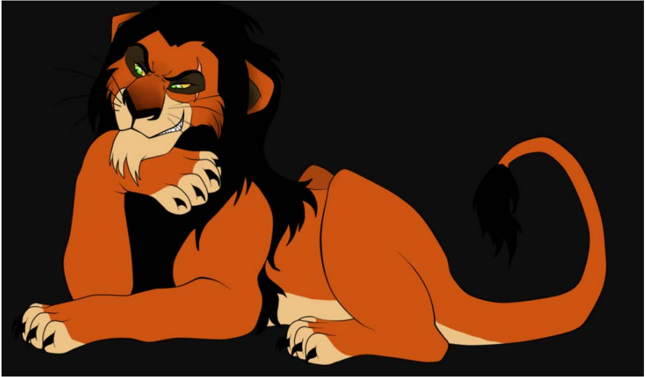
Scar, from the Lion King