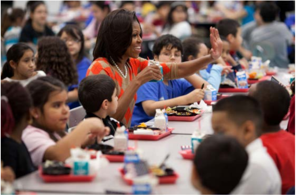
Former First Lady, Michelle Obama

https://obamawhitehouse.archives.gov/blog/2012/01/25/healthy-changes-menu-school-lunches